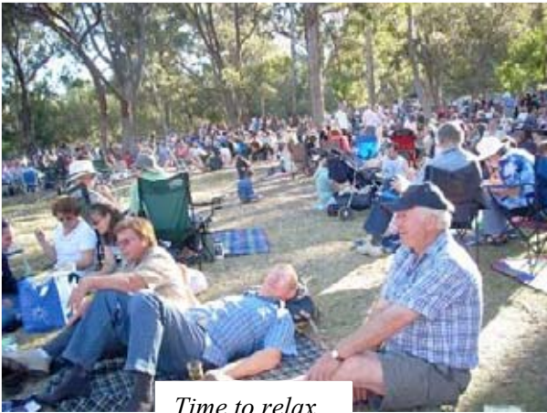
Time to relax

Due to the mild temperature, we had a very good take up rate from our members and friends – 24 people in all. One thing I had failed to factor in for the afternoon was that there would be two weddings held at the ANBG that day. The impact for us was that most of the parking was cordoned off, and the remaining parking filled very quickly as people started arriving. This meant a bit of a delay in getting our walk underway while members searched for alternative parking, and then had to cart their eskies, chairs and rugs back up the hill to the Visitors Centre. We are now forewarned for next time.